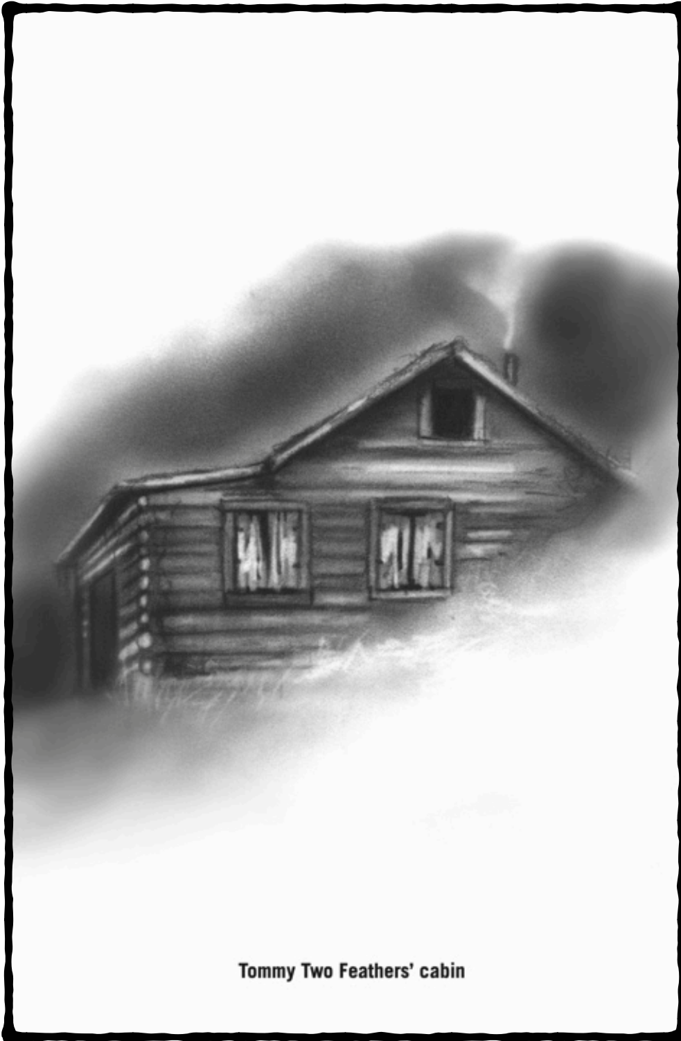
Tommy Two Feathers' cabin

THE SUN WAS JUST DROPPING BELOW THE MOUNTAINS WHEN THE FIRST SNOWFLAKES STARTED TO FALL.