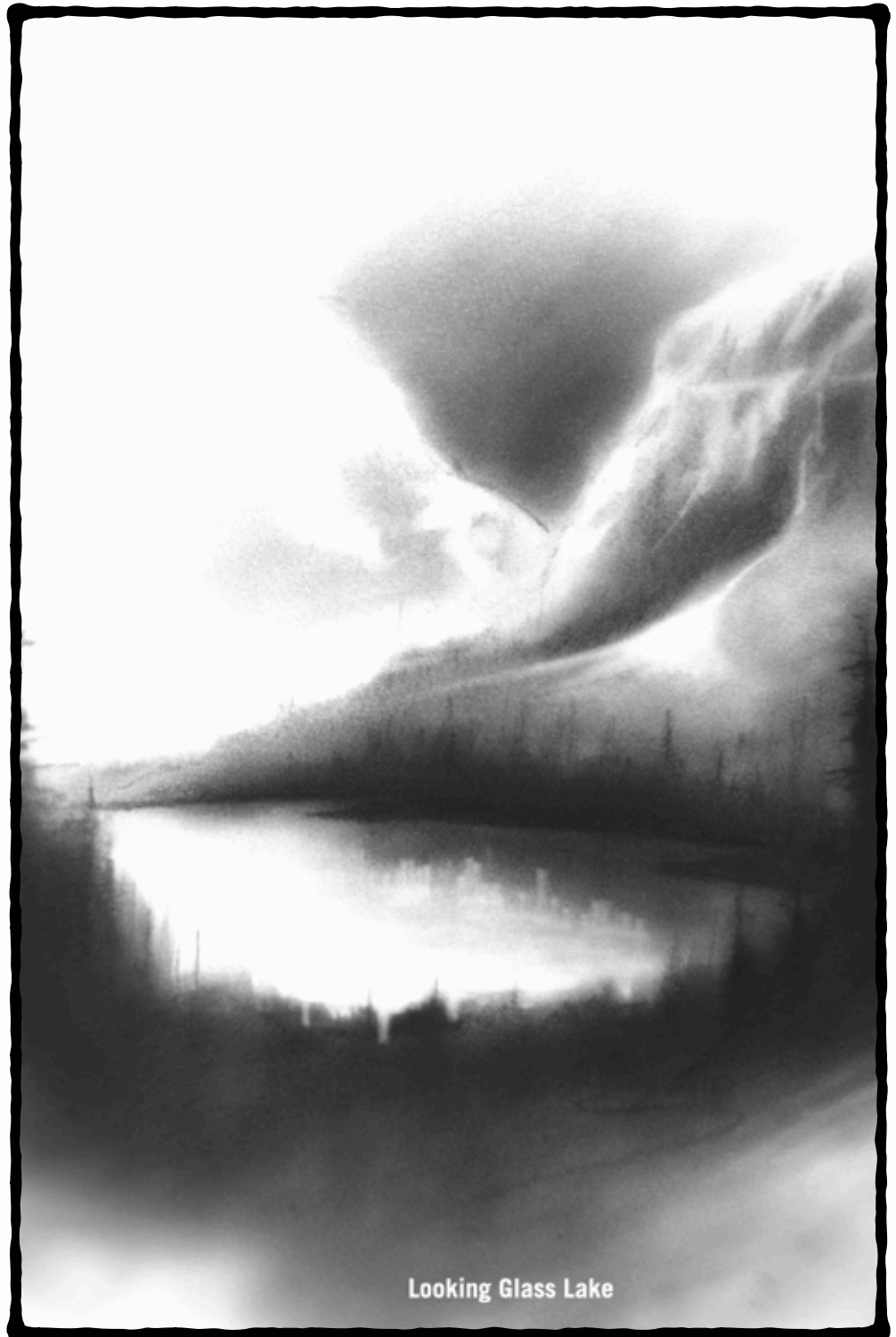
Looking Glass Lake

THE SURFACE OF THE LAKE WAS FLAT AS GLASS, AND THE STILL WATER REFLECTED SUNLIGHT AS IF IT WERE A MIRROR. LOOKING AROUND, THEY COULD SEE THAT THE LAKE WAS PERFECTLY CENTERED IN THE MIDDLE OF A SMALL BOX CANYON, ENCIRCLED BY SOARING, SNOW-CAPPED CLIFFS. AWED BY THE STUNNING VISTA BEFORE HIM, JOCKABEB TURNED TO THE OLD INDIAN WHO WAS NOW GRINNING FROM EAR TO EAR. "MR. TWO FEATHERS, THANK YOU SO MUCH FOR BRINGING US HERE. I FEEL LIKE I'M IN AN OUTDOOR CATHEDRAL. IT'S ONE OF THE MOST BEAUTIFUL PLACES I'VE EVER BEEN!"