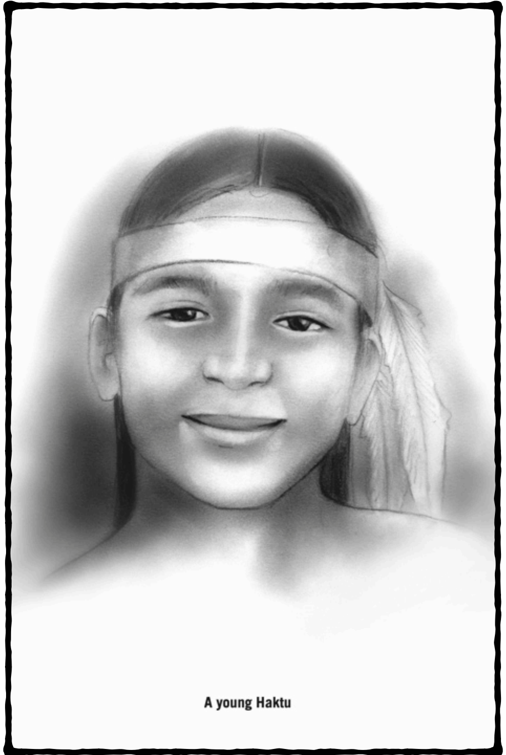
A young Haktu

APPARENTLY, THE TRIBE'S CHIEF HAD LOST ONE OF HIS TWIN BOYS IN SOME CAVE BACK EAST."